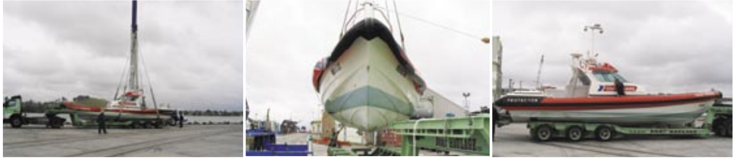
Tally Rescue begins her journey southward