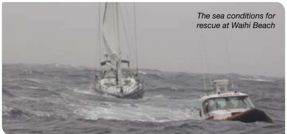
The sea conditions for rescue at Waihi Beach

At the same time Tauranga, Whakatane, Opotiki and Maketu Sea Rescue were assisting in the search for five people who had sent a text to family advising they were