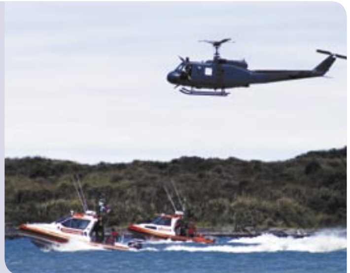
Coastguard Wanganui's new 7.3m Naiad and South Taranaki's 6.8m Naiad prepare for another winch exercise