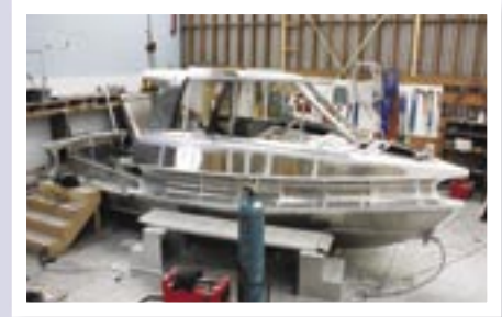
Coastguard Kapiti Coast's new AMF under construction at Wanganui