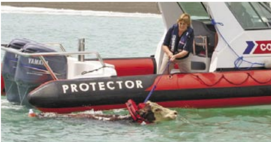
Coastguard South Canterbury lends a hand with this unusual rescue