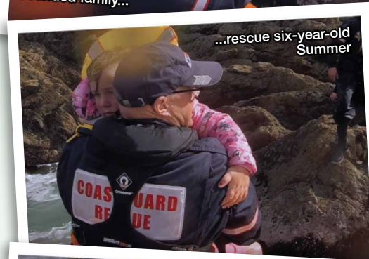
...rescue six-year-old Summer