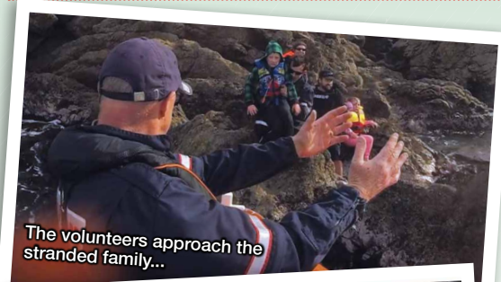
The volunteers approach the stranded family...