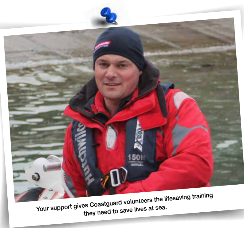
Your support gives Coastguard volunteers the lifesaving training they need to save lives at sea.