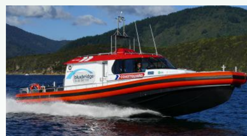
Your support for our crews has brought many people home safely.

Bluebridge Rescue's highly trained crew couldn't be there for the people of Marlborough and its many visitors without you. Thanks to your support, Coastguard Marlborough have the skills to provide lifesaving care, bringing 100 people home safely to their families since 2016.