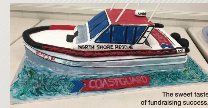
The sweet taste of fundraising success.

We always welcome fundraising drives organised by our supporters, anytime, anywhere. If cakes aren't your thing, how about selling tickets to a fish supper or nautical quiz night? There are also lots of sporting challenges taking place around the country so whether you run, swim, row or bike, choose to raise funds for Coastguard to save lives at sea!