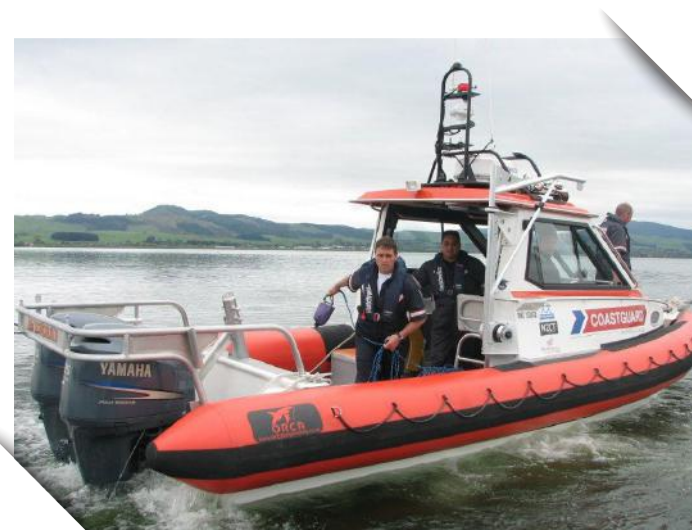
Coastguard volunteers will drop everything to respond to an incident, but they couldn't do this without you.