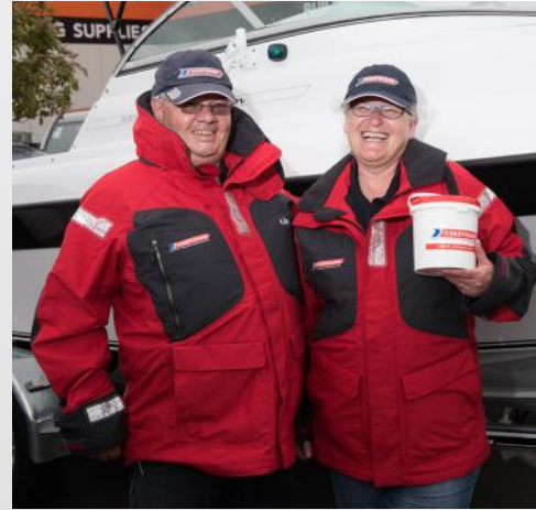
Selling lottery tickets is one of the many things our volunteers do to save lives at sea

It can be challenging for each Coastguard crew to find enough volunteers to sell tickets so be sure to buy one if you see them! You will walk away knowing that you've helped your local Coastguard crew and also have the chance to win a fantastic prize, such as a new car, boat, holiday, or a Mitre 10 kitchen makeover.