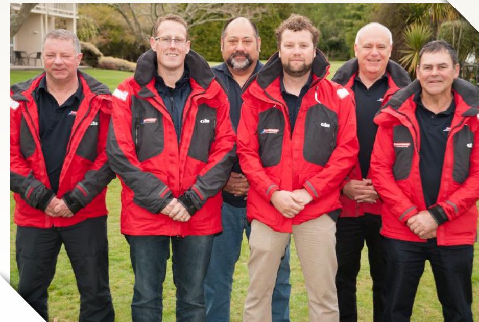
Thanks to your incredible support, our crews are always rescue-ready.

There is little doubt the outcome could have been much worse if the crew didn't have the skills and experience to act so quickly. Thanks to your support in providing training and gear for our volunteers, the paddler was rescued and lived to see another day.