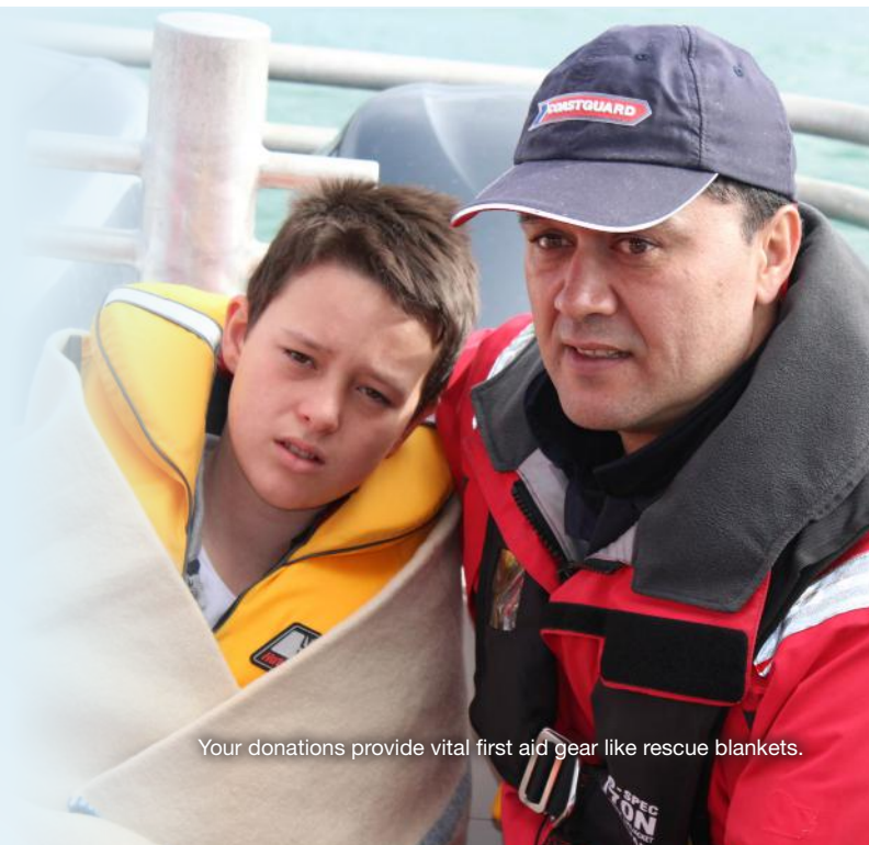
Your donations provide vital first aid gear like rescue blankets.

Without you we couldn't save lives at sea.