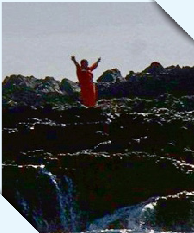
Rescued: A survivor spots Coastguard Northland Air Patrol

“They were waving, really waving. Where they were, at high tide you couldn't see the rocks and they had been there overnight. The Coastguard air patrol crew found the men where no-one else had thought to look.”