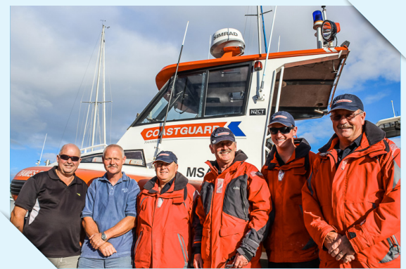
Firth of Thames survivors and Coastguard crew.

Coastguard's Mayday Rescue Appeal raises funds to train all 2,300 Coastguard volunteers around the country, helping them save lives when no-one else can help. Thank you!