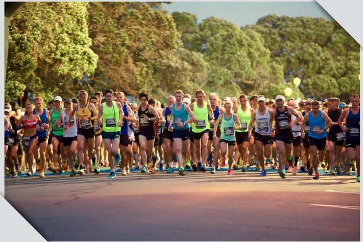
Run the Auckland Marathon for Coastguard!