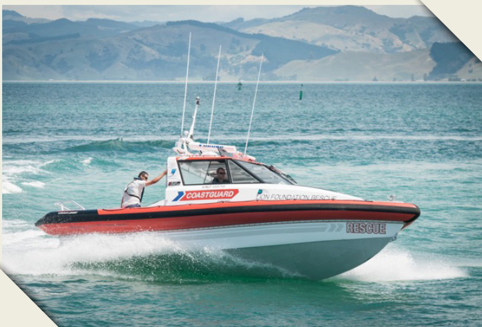
Volunteers on board Gisborne Lion Foundation Rescue