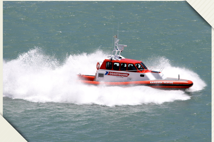
Kaikoura Rescue heads out on an urgent call